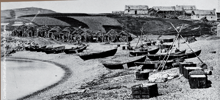
Stennes haaf station